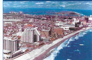
The spectacular Atlantic Ocean Shore