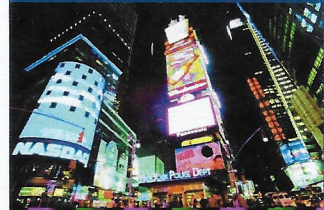
New York City - The city that never sleeps

Day 7: Today after enjoying a Continental Breakfast, you depart for home... a time to chat with your friends about all the fun things you've done, the great sights you've seen and where your next group trip will take you!