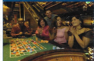
World-class gaming in Atlantic City awaits!