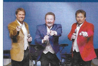
SMITH MORNING VARIETY SHOW