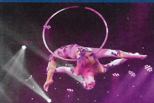
"ARRAY" - Pigeon Forge's Newest Variety Show

Diamond Tours inc. Bringing Group Travel to a Higher Standard®