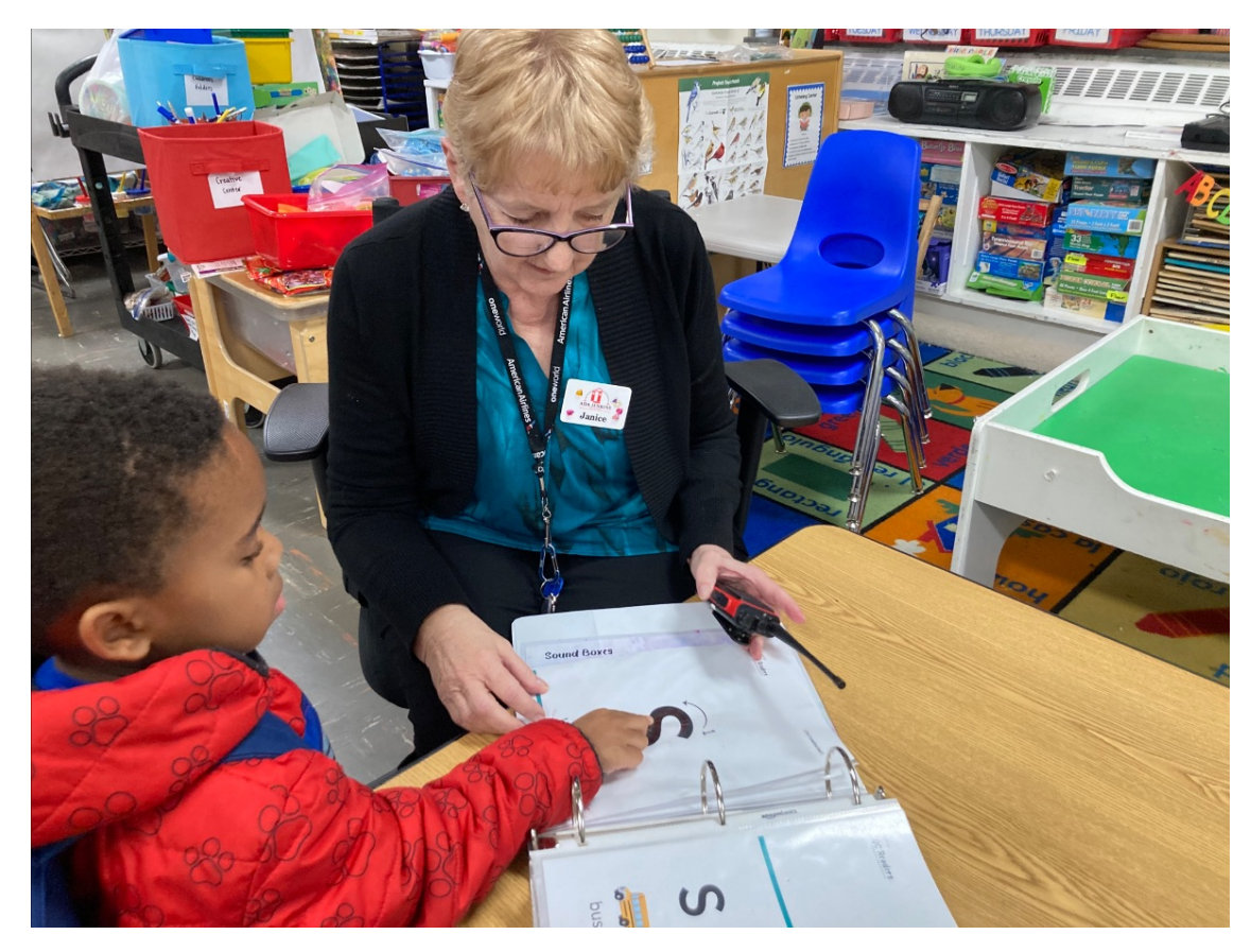
QCR in use in Ada Jenkins Center's LEARN Works program