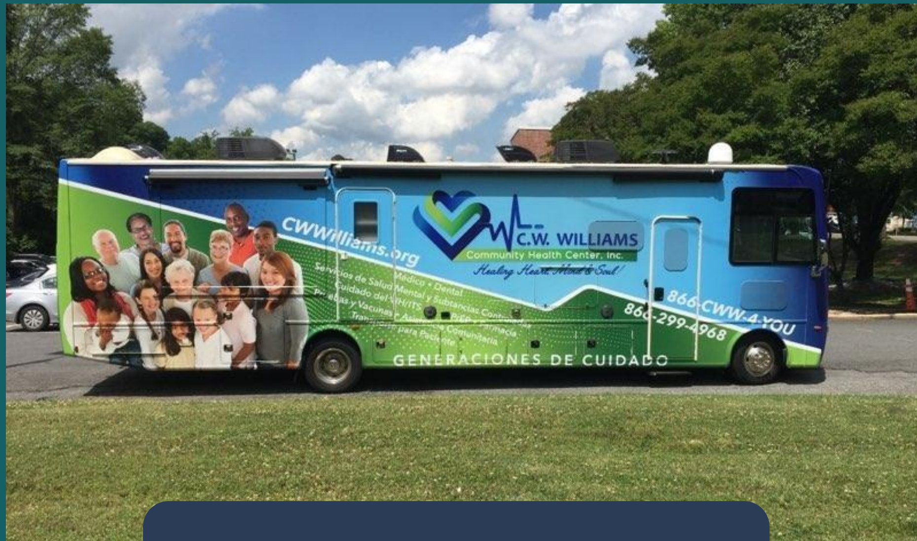
Medical Mobile Unit