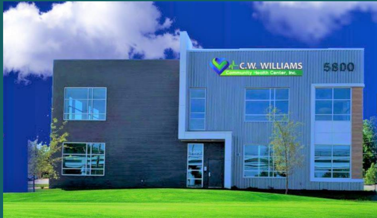
South Charlotte Medical Site