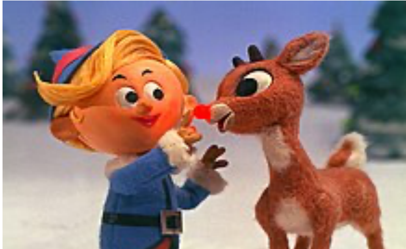
Rudolph the Red-Nosed Reindeer