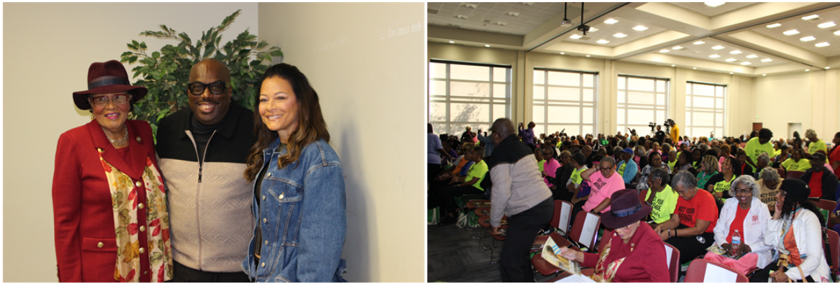
Attending the Black Health Matters Expo and Summit in Charlotte

On Saturday, November 16th, I addressed the Black Health Matters Expo and Summit at Friendship Missionary Baptist Church. Black Health Matters, a leading national health advocacy organization promoting health and wellness, hosted the event featuring medical screenings and conversations with experts and health agencies. I appreciate Black Health Matters for their expansive work in health education and community outreach. When we are equipped with knowledge, we gain agency in our own health, and we are able to advocate more effectively for ourselves and our loved ones. As co-founder and co-chair of the Black Maternal Health Caucus, in my time in Congress, I have upheld the belief that access to quality, affordable health care is a most basic human right.