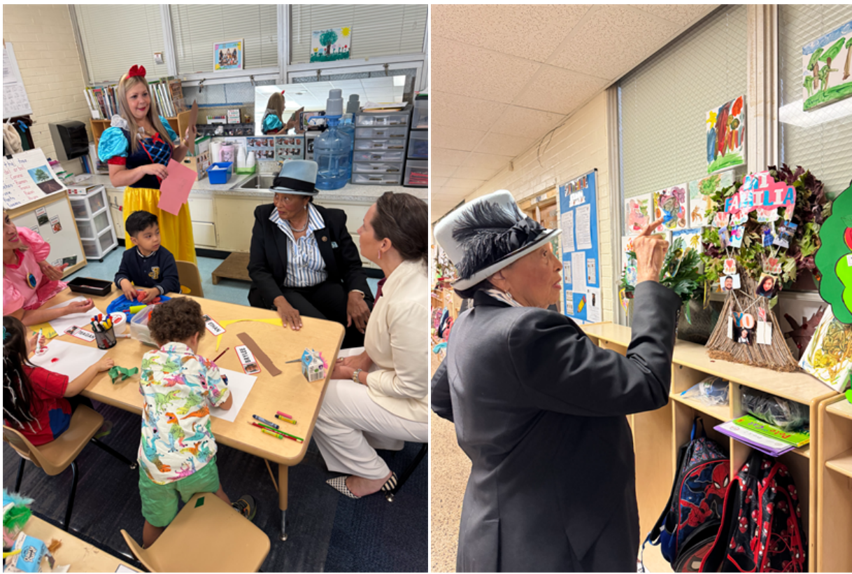
Visiting the Charlotte Bilingual Pre-school

I serve on the Education and Workforce Committee in Congress, and I am determined that we consider a National Head Start program so every American child has the same opportunities as the kids at Charlotte Bilingual Pre-school. On October 31st, I had the chance to visit the Charlotte Bilingual Pre-school. As their website says, "Charlotte Bilingual Preschool's vision is that Charlotte-Mecklenburg is a place where differences in language and culture are mutually enriching, and all children have greater access to advantages and opportunity." While quality childcare has become harder to find and increasingly expensive in North Carolina, pre-Kindergarten is connected with a healthier, more productive, more law-abiding adulthood.