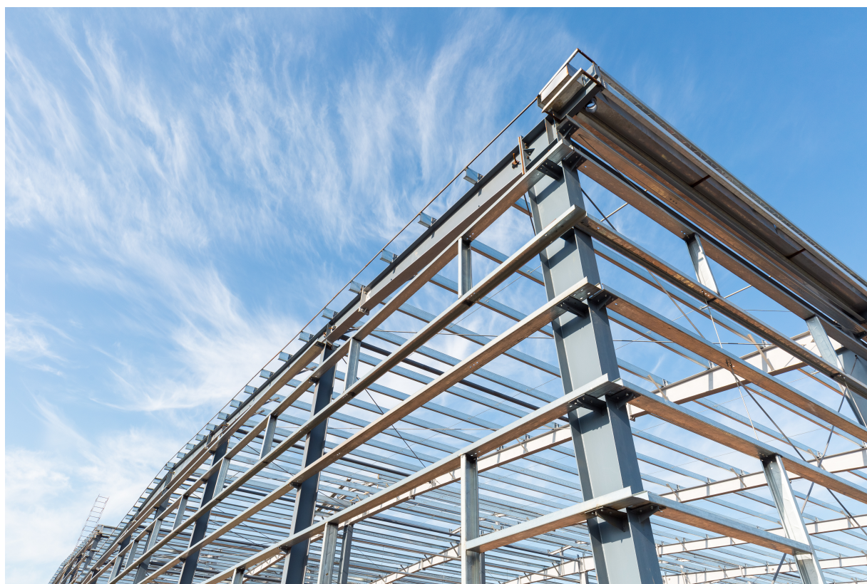
Nucor invests in sustainable steel

On November 14th, the US Department of Energy announced it would make another substantial grant to Charlotte, this time to Nucor, a steel manufacturer, to help reduce carbon emissions in manufacturing. This grant is part of nationwide investment of $4 million in 10 projects, designed to harness the processing power of the world's most powerful supercomputers, strengthen America's manufacturing competitiveness, and move the country closer to an equitable clean energy future for all Americans. These kinds of investments ensure good jobs today, and a sustainable future for generations to come. We are planting trees today, under whose shade our children and grandchildren will sit. Under Secretary Granholm and President Biden, our Department of Energy has invested in a future for all Americans, and it's being built in Charlotte.