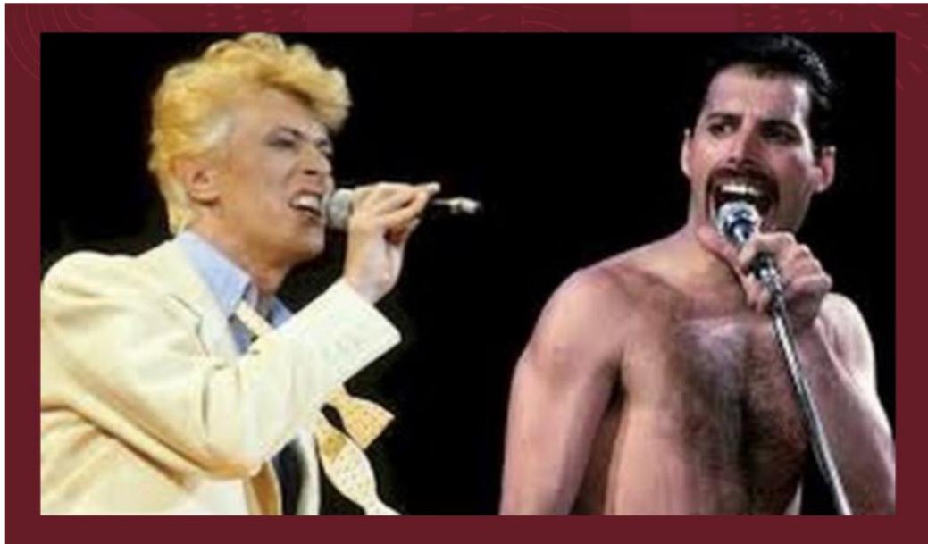
David Bowie & Freddie Mercury – Click Photo for “Under Pressure” Video

Back in 1981, David Bowie and Freddie Mercury's lyrics were and remain so powerful and prophetic, summing up this life, our lives –