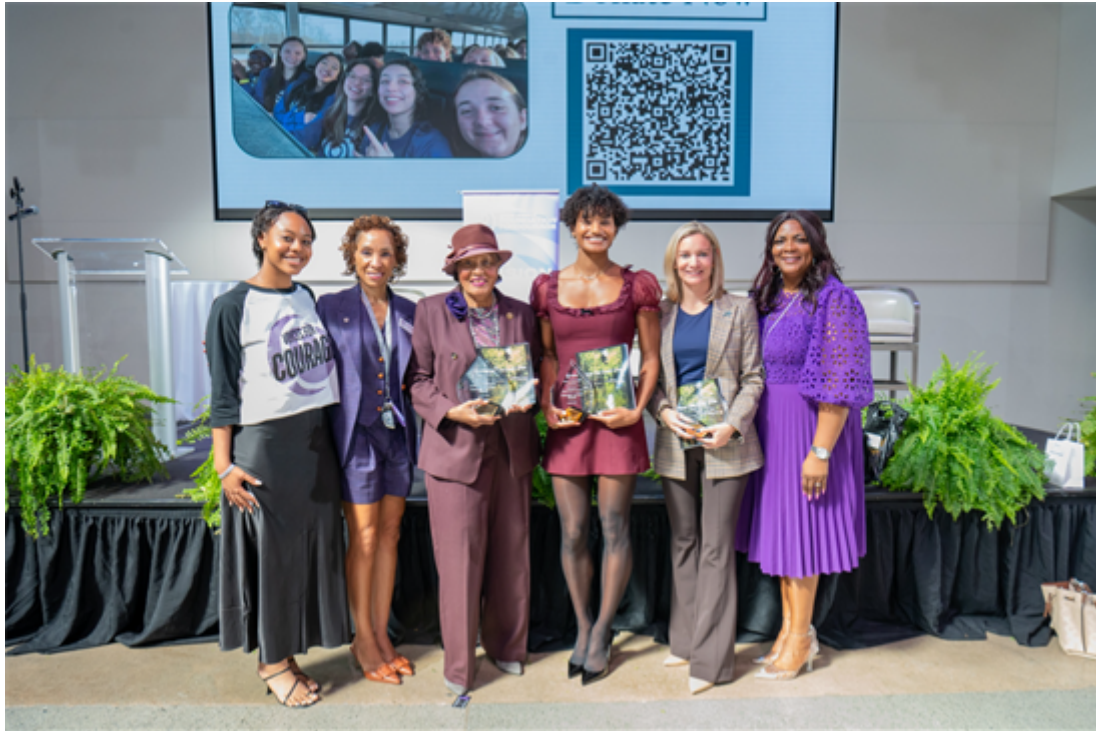
Jamie Kimble Foundation for Courage Voices for Courage Luncheon

Thank you to the Jamie Kimble Foundation for courage (JKFC) for recognizing me as one of our community's "Voices for Courage" during their annual luncheon themed "Courageous Engagement: Violence Prevention for Our Youth" on October 22nd. The Jamie Kimble Foundation for Courage is an organization named for a young woman who senselessly lost her life, and is devoted to preventing and responding to incidents of domestic and sexual violence among teens and young adults. We appreciate your work to educate young adults on how to engage in healthy relationships and recognize the signs of abuse before they escalate.