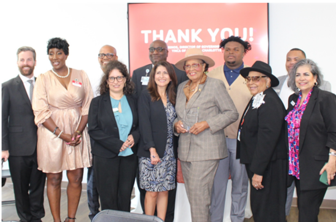
Stratford Richardson YMCA's new Atrium Health Community Care Primary Care West Boulevard Family Medicine Clinic.