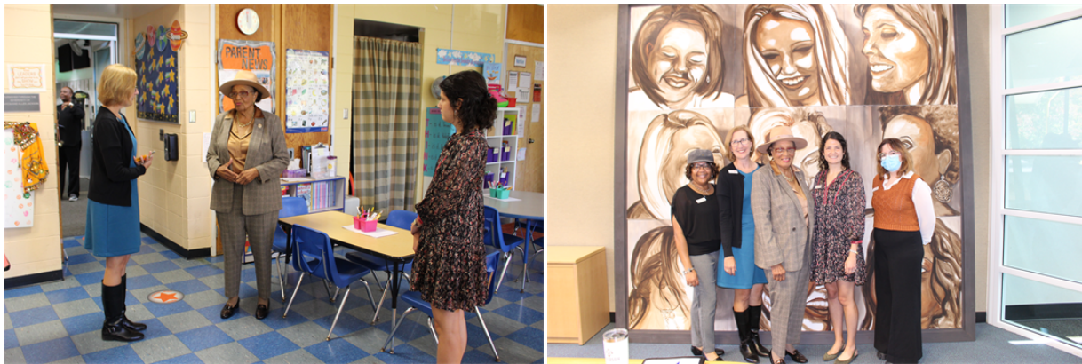
Meeting with the leadership of the YWCA Central Carolinas

Access to affordable housing is an issue I am most concerned about. On October 24th, I met with the leadership of the YWCA Central Carolinas to follow up on the good work they are doing to provide transitional housing to Charlotte families in need. YWCA also helps to provide a pathway to more permanent housing later on. The Park Road facility will break ground on eighty affordable housing units to be added to their campus next year.