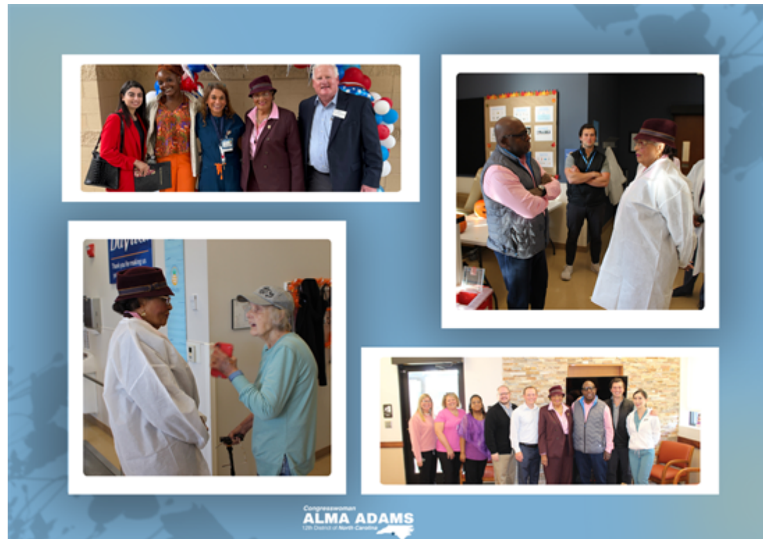
Touring the Fresenius Kidney Care Charlotte Clinic and DaVita Dialysis Huntersville

On October 29th, my staff and I visited the Fresenius Kidney Care Charlotte Clinic in East Charlotte and DaVita Dialysis in Huntersville to follow up on the work being done to keep Charlotteans with renal disease in the best possible health.