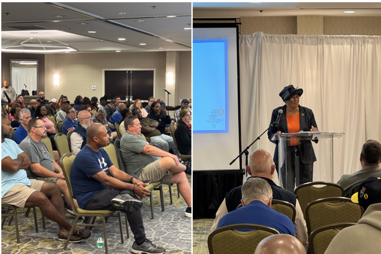
Addressing the North Carolina chapter of the National Association of Letter Carriers