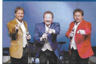
SMITH MORNING VARIETY SHOW