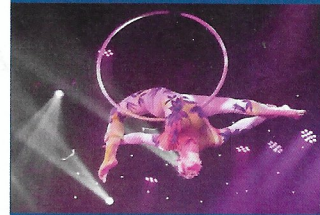
"ARRAY" - Pigeon Forge's Newest Variety Show

Diamond Tours inc. Bringing Group Travel to a Higher Standard®