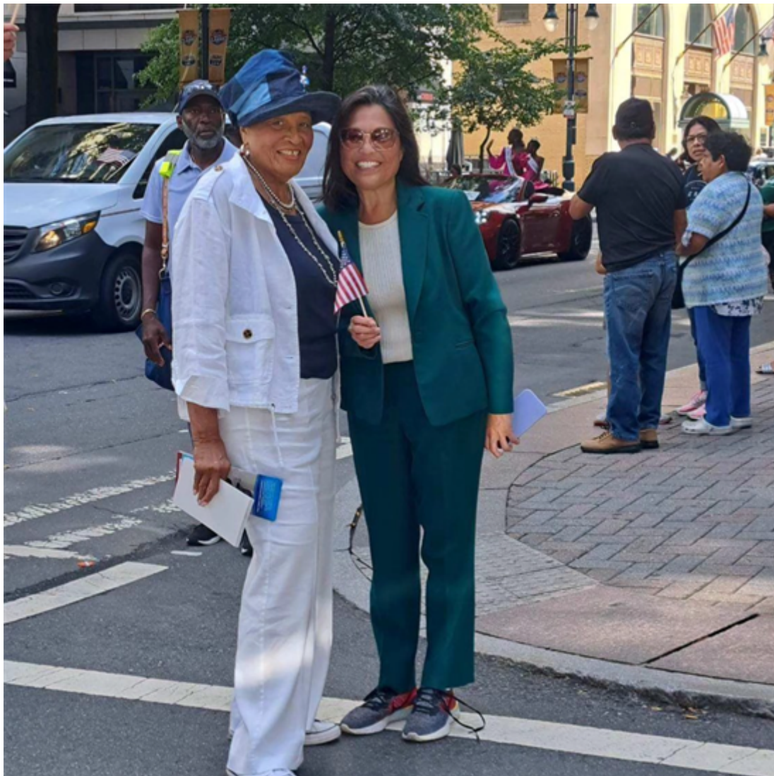
Congresswoman Adams is pictured at the Charlotte Labor Day Parade with U.S. Department of Labor Acting Secretary Julie Su.