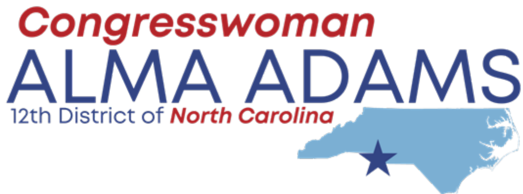
Congresswoman Alma S. Adams, Ph.D.