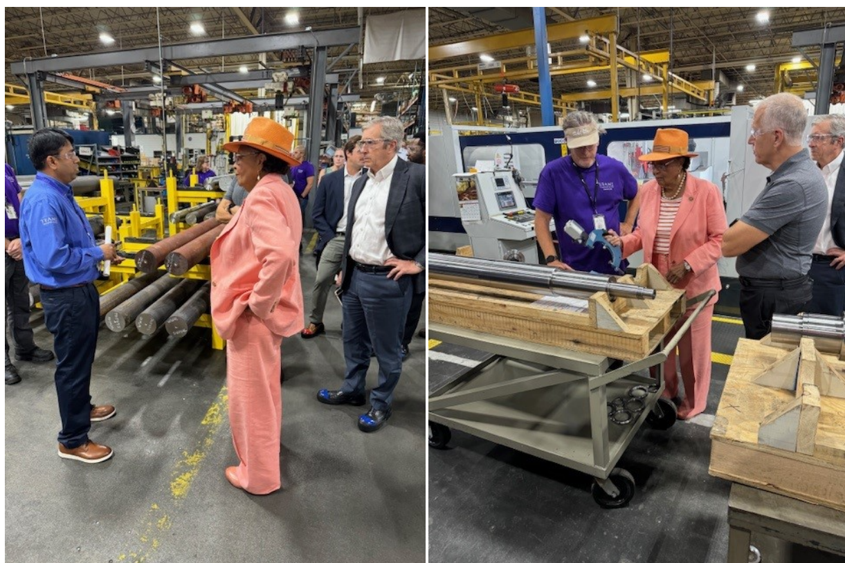
Pictures from my visit to Trane Technologies in August, where they recently marked three million working hours, over 10 years, without a safety incident.

As the Ranking Member of the E&W Subcommittee on Workforce Protections, I am particularly passionate about worker safety.