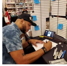
2023 Comic Book Media Arts Campaign Contribution Recipient