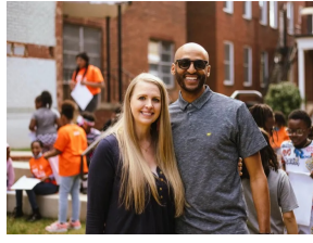
2023 Literary Arts Campaign Contribution Recipient