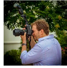
2023 Photographic Arts Campaign Contribution Recipient