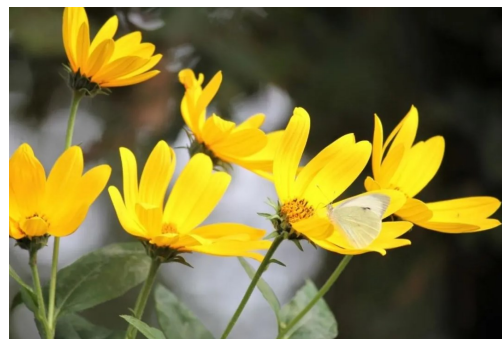
Appalachia sunflower ( Helianthus atrorubens )

will be out of balance. Entomologist Doug Tallamy and his organization, Homegrown National Park, are calling on us to help to increase biodi-