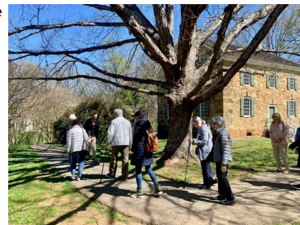
BKDs at the 1774 Hezekiah Alexander House.

Fourteen women and men participated in the first "field trip" of the new League group, getting to know one another and learning a lot of Mecklenburg history in the process. Members attending decided that the next event would be strictly social with a covered dish brunch on April 25 at the League office. A volunteer is needed to help organize the event and send out invitations. If you can be a one-time leader for April 25, send an email to membership@goleaguego.org . Watch your email and the League's website, www.goleaguego.org for details.