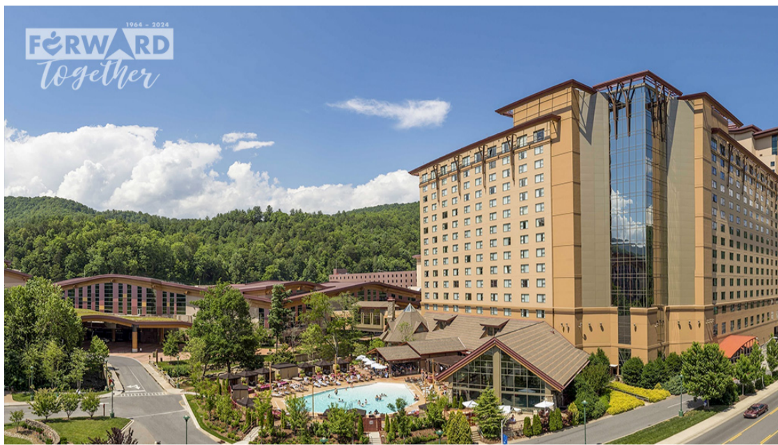
Harrah's Cherokee Casino Resort - 777 Casino Drive, Cherokee, NC