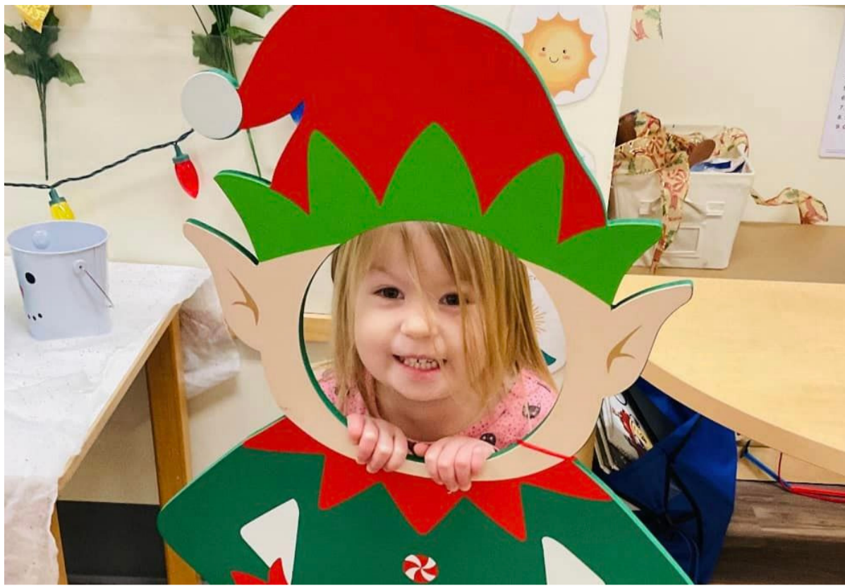
This elf showed up for Spirit Week at Macon Program for Progress