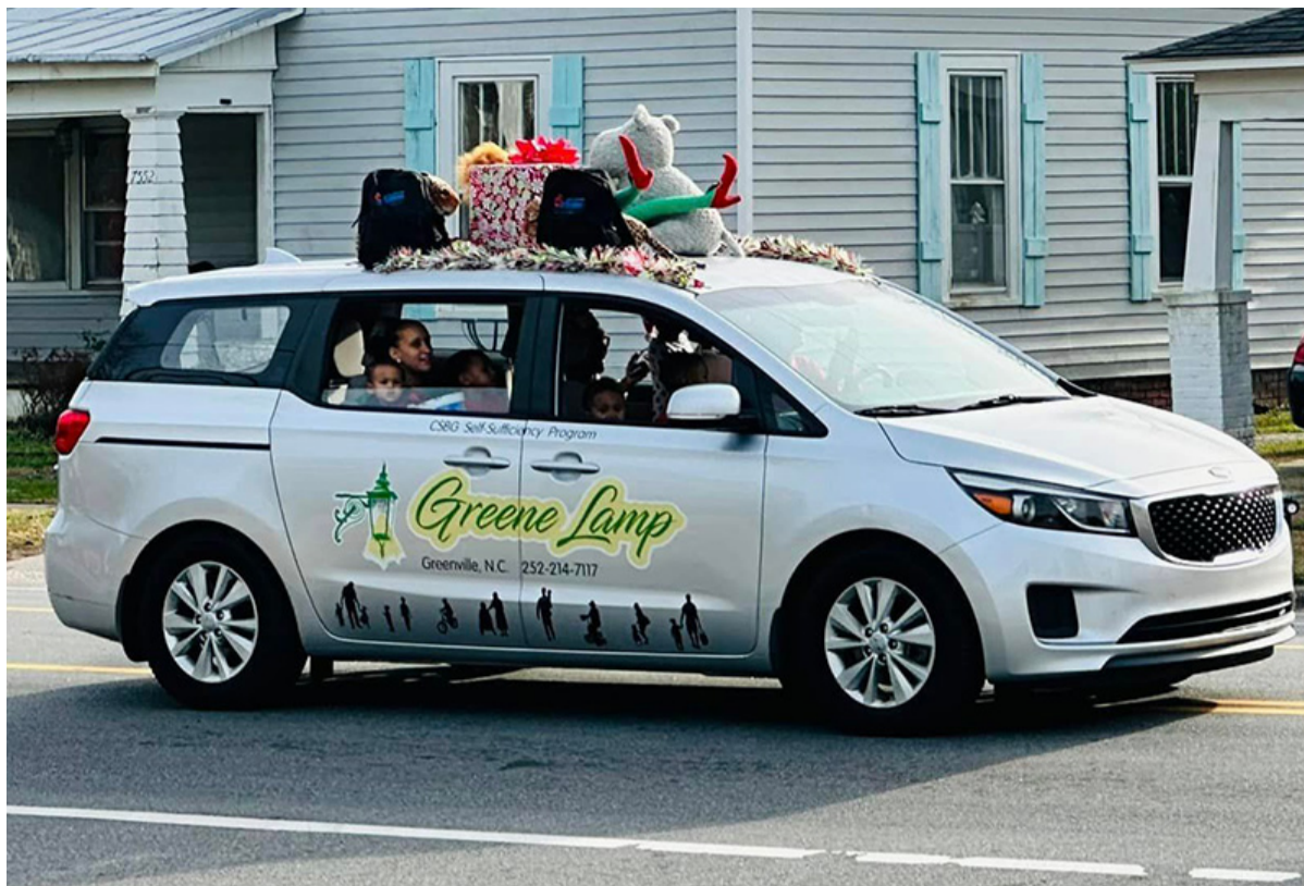
Greene Lamp Community Action CSBG Self-Sufficiency Program takes part in the Town of Grimesland, NC, Christmas Parade.