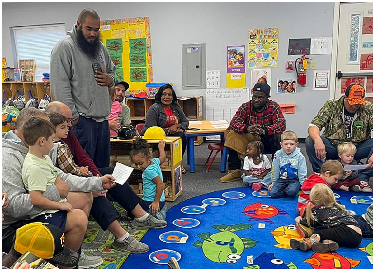
Male Involvement Day, “Show and Tell Dad Edition” at Cherryville Head Start!