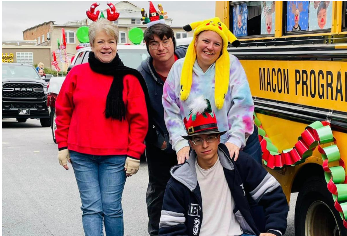
Macon Program for Progress staff get ready for the Franklin Christmas Parade!