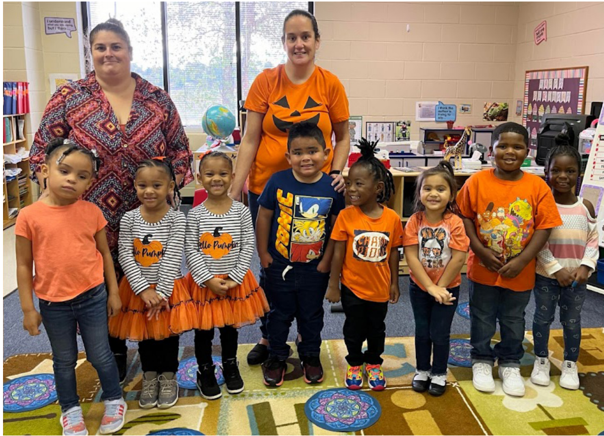
Our Hoke County Head Start Center celebrated Unity Day by wearing orange. Here are photos of the staff and kids. Unity Day serves as a reminder to prevent bullying and foster a safe and inclusive environment for everyone. By wearing orange, we stand together against bullying and promote kindness and respect.