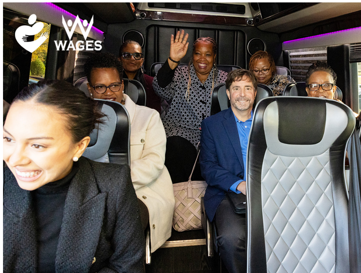
The Wheels on the Bus ...