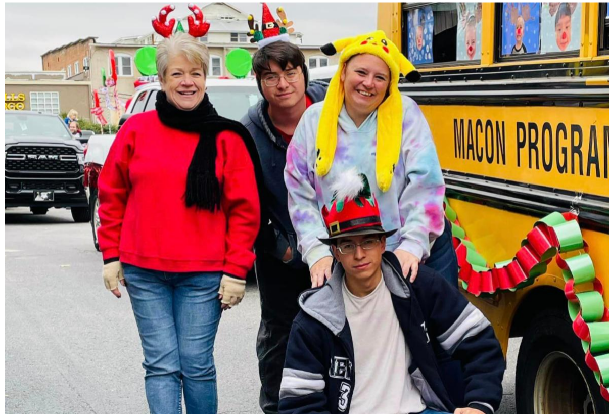
Macon Program for Progress staff get ready for the Franklin Christmas Parade!