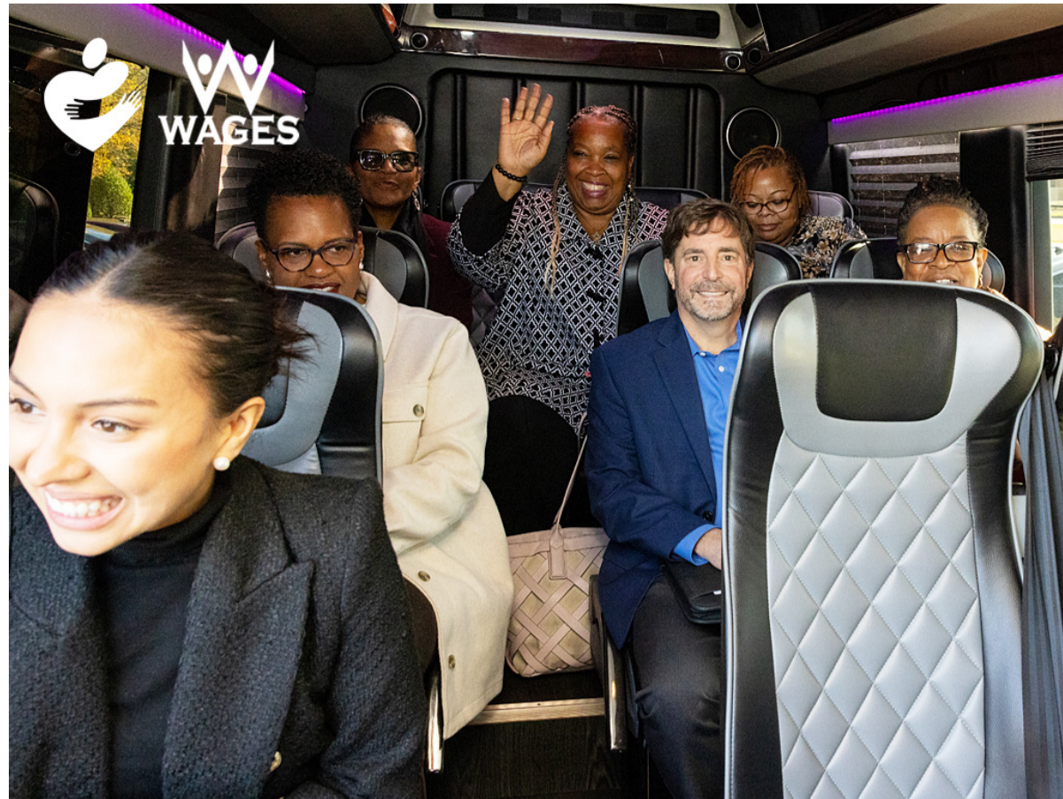
The Wheels on the Bus ...