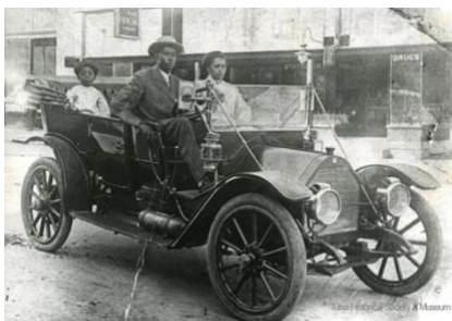
Before 1921 Riot

Additionally, much of the economic benefits of global trade have historically gone to European nations throughout the past eras of imperialism and colonialism. And much of the scholarly discussion on trade focuses on Europe as the center of that trade. Since the thought behind global trade centers on Europe, Africa and its Diaspora fails to place itself at the center of thought in terms of having its people benefit from said trade. It is notable that Africa is resource rich,