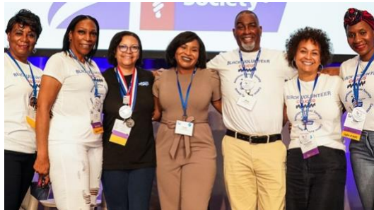
North Carolina BVC Team

I'm bi-partisan as District 12 Lead Advocate with Congresswoman Alma Adams with the American Cancer Society Cancer Action Network (ACSCAN). Also a member of the (ACSCAN) Black Volunteer Caucus. (BVC)