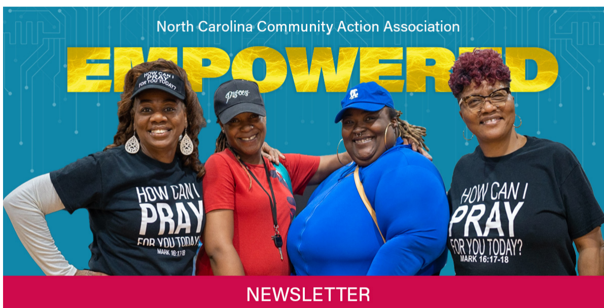
Volunteers at our Kinston, NC, DIAPER Project resource event

Empowered Newsletter | November 2023 | Issue 11