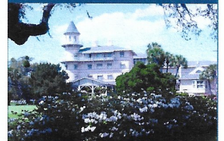
Jekyll Island - Georgia's elite coastal barrier island