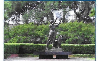
Savannah - the "Belle of Georgia"