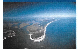
Aerial view of Amelia Island