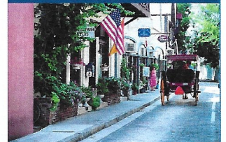
Historic St. George St