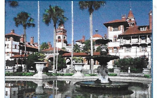
St. Augustine, our Nation's Oldest City

Day 4: After enjoying a Continental Breakfast, you'll depart for a NARRATED CRUISE on the ST. JOHN'S RIVER. Later, you'll depart for home... a perfect time to chat with your friends about all the fun things you've done, the great sights you've seen and where your next group trip will take you!