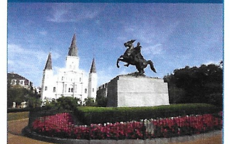
GUIDED TOUR OF NEW ORLEANS