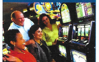
Give Lady Luck a Spin!