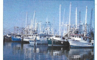
The Beautiful Gulf Coast Awaits

Day 6: Today after enjoying a Continental Breakfast, you depart for home... a perfect time to chat with your friends about all the fun you had and where your next group trip will take you!