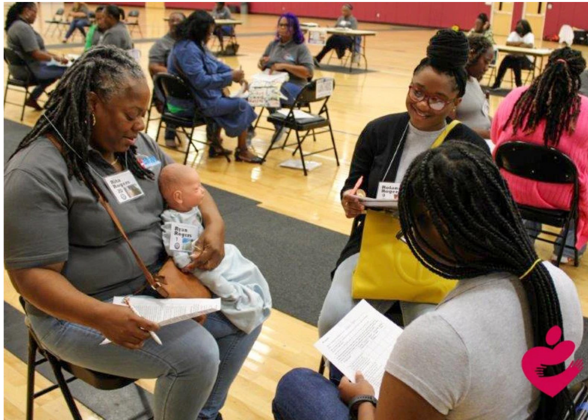
Poverty simulation at NEW Community Action

NCCAA recently hosted our popular Poverty Simulations at Blue Ridge Community College in Flat Rock and at NEW Community Action in Rocky Mount. Thank you to all who helped and participated!