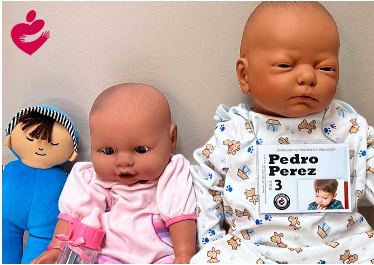
NCCAA recently upgraded the dolls used in their NC Poverty Simulation Experience. The ready-or-not-tots are heavy, cry, and are typically used in high schools to give students some insight into the challenges of caring for a baby. They've brought an added element of realness to the Poverty Simulation experience. From left to right, you can see how we've grown!