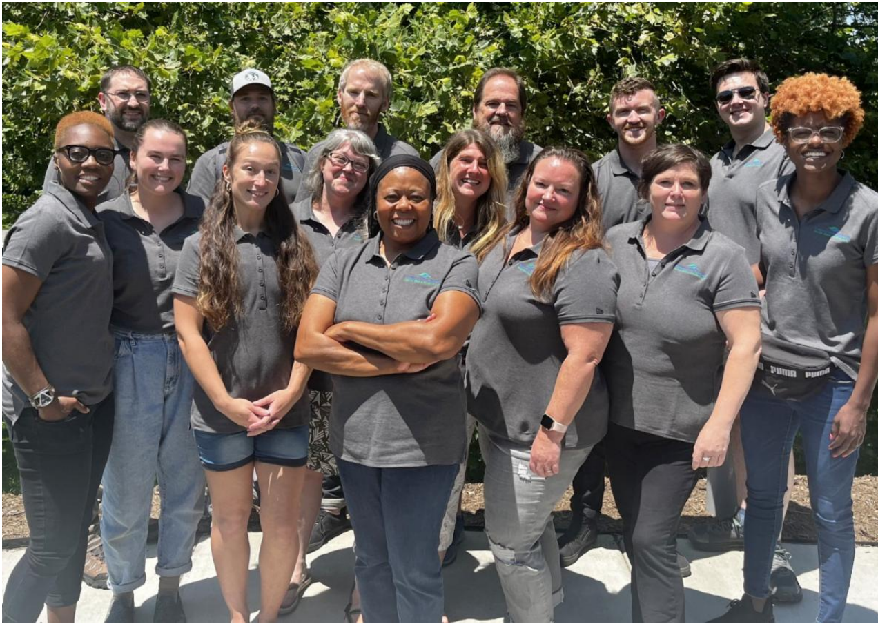
15 CAO Economic Development staff members held a three day, two host location retreat in July. It kicked off at the Asheville Area Habitat for Humanity, moved to the Weaverville Community Center for day two, and closed with trips to Board and Brush Asheville and to the Weaverville B.E.A.R. Closet to volunteer.