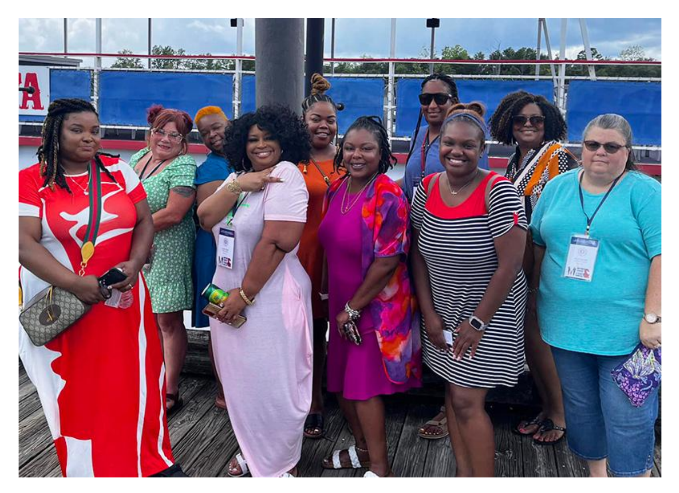
The Greene Lamp crew was in Wilmington for the for 2023 Summer Leadership and Family Engagement Conference