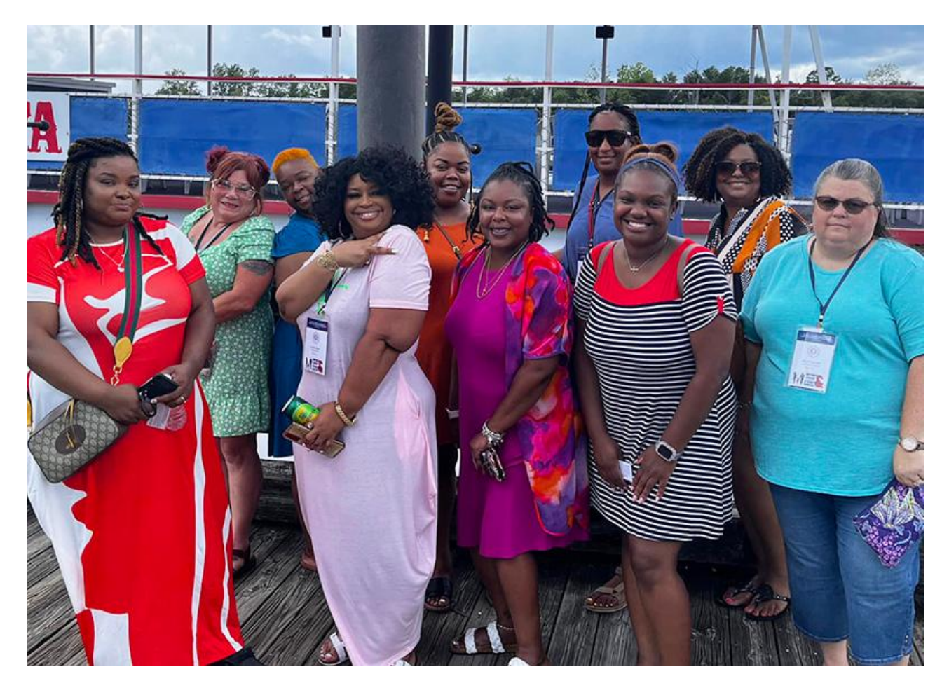
The Greene Lamp crew was in Wilmington for the for 2023 Summer Leadership and Family Engagement Conference