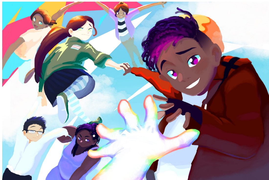
"Reaching Out" by Ethan Eastridge