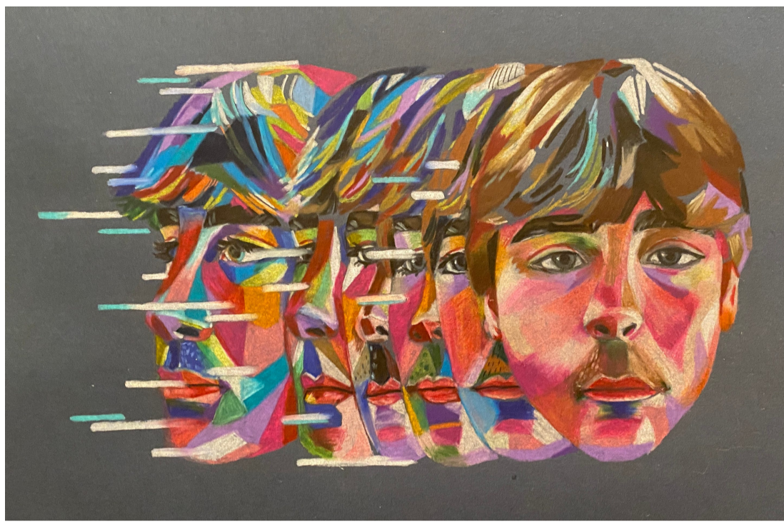
"Glitch" by Bridget Lyon