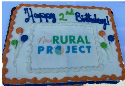
The birthday cake from last week's celebration in Mecklenburg County!

We are writing to invite you to join us as we continue to celebrate our 2nd birthday as the New Rural Project. We had a blast at our Mecklenburg County birthday bash last week and we can't wait to do it all over again in Moore County on Thursday!