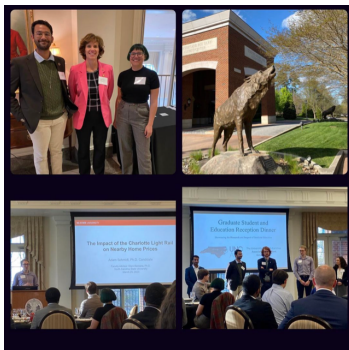
Last week I attended a legislative reception to hear from graduate students from across the UNC System. They were engaging speakers, doing impressive research and teaching in their field, including AI, transportation, food scarcity, film, and more. NC's future is bright.