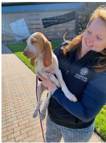
Last week the American Kennel Club stopped by Raleigh for their "Canines at the Capitol" event. It was a nice treat to visit with this adorable puppy and other unique dogs.