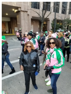
Senator Waddell and the AKA sorority members

I participated in the Charlotte MLK Day March, and marched with three different groups to support them through the event.