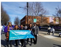
Senator Waddell and the National Council of Negro Women.