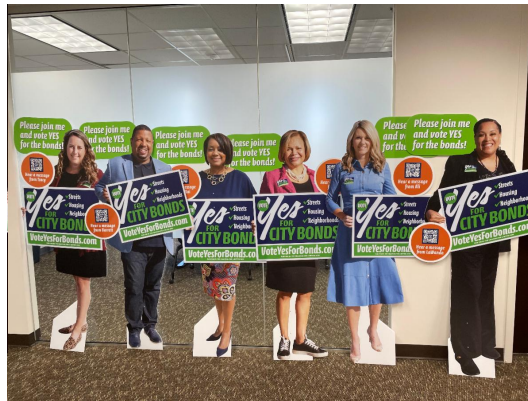
The Charlotte Observer Endorsement

Visit our website's early voting page for a list of all locations.