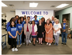
Senator Waddell and the Mecklenburg Delegation tours E2D, Inc.