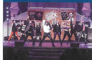
Anthems of Rock

Diamond Tours inc. Bringing Group Travel to a Higher Standard®