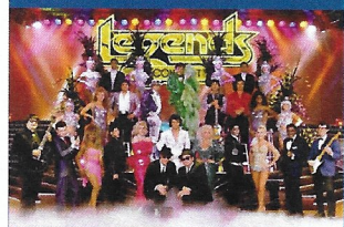
Exciting Legends in Concert