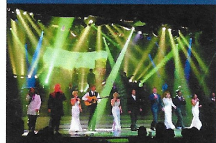
Fabulous Carolina Opry