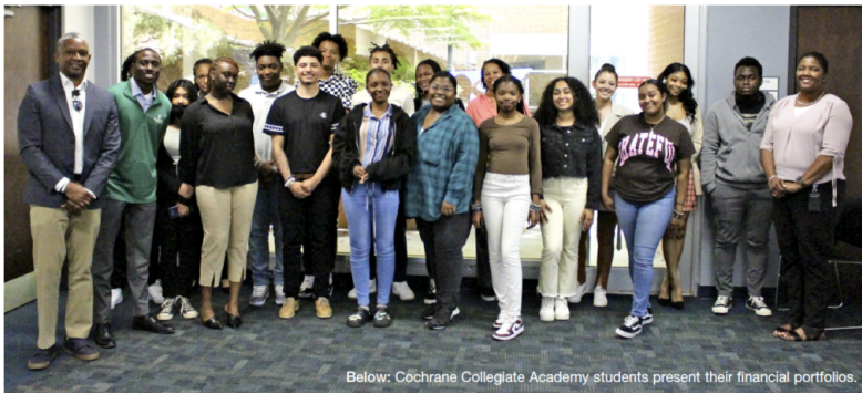
Below: Cochrane Collegiate Academy students present their financial portfolios.

Some of you still may not know that Pride Magazine has a nonprofit arm called PEEP. Founded in 2007, PEEP has relaunched as the Pride Educational Empowerment Program with three foundational pillars: career mentoring, entrepreneurship, and wealth creation.