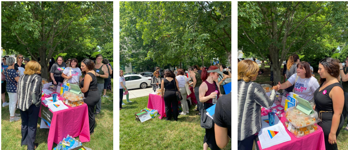
Senator Waddell answers questions and discusses upcoming legislation.