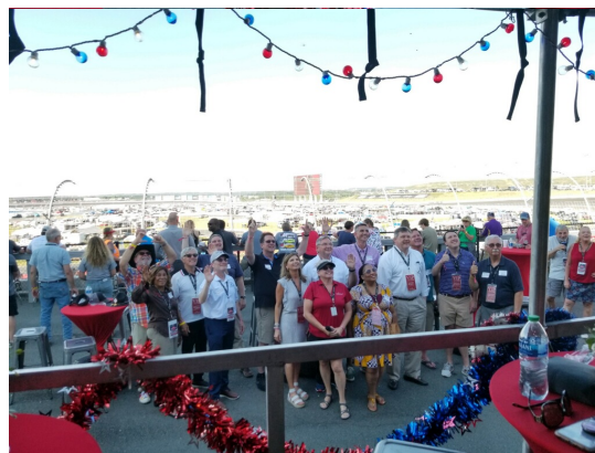
North Carolina Legislators come together for the Coca Cola 600 race and activities.