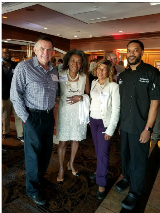
Senator Waddell congratulates the Lt. Governor of Virginia - Winsome Earle-Sears (2nd from

Senator Waddell participated in the activities at the 63 rd running of the Coca-Cola 600.