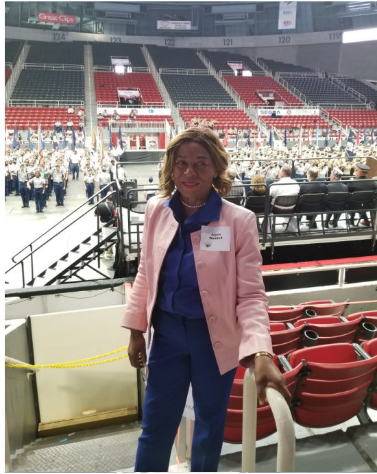
Senator Waddell participates in a JROTC CMS Cadet Achievement Awards program in Mecklenburg County.