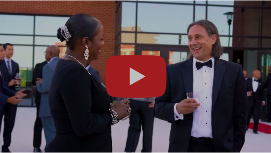
Whitney M. Young, Jr. Awards Gala Recap