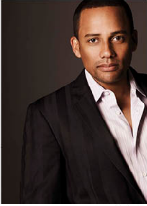
Featuring HILL HARPER Award-winning Actor, Best-selling Author Founder/CEO, The Black Wall Street Digital Wallet