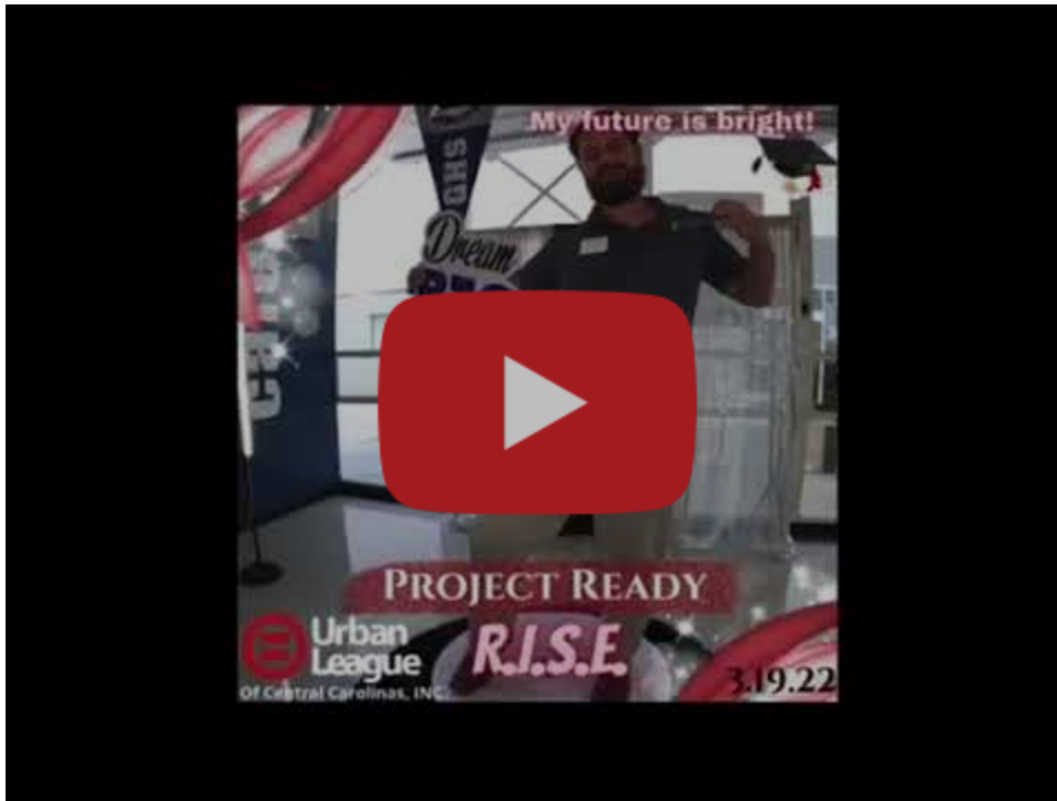
Project Ready R.I.S.E. - 360 View of Success