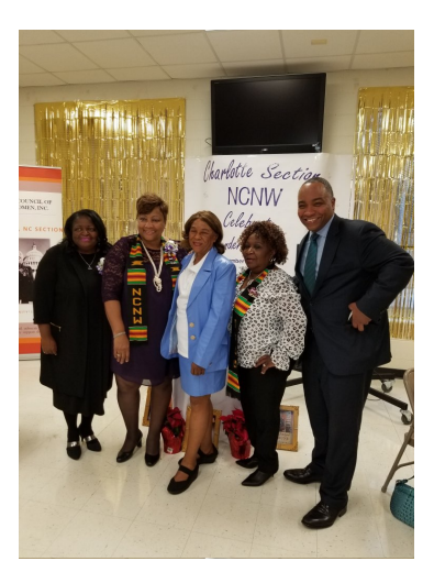
Senator Waddell celebrates Founders' Day celebration with members of National Council of Negro Women (NCNW).