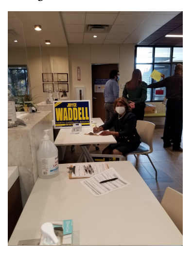
Senator Waddell prepares to file for 5th term.