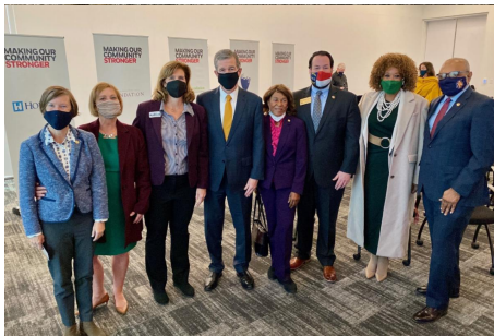
Mecklenburg Delegation members with Governor Cooper, who was instrumental in Honeywell's relocation to Charlotte