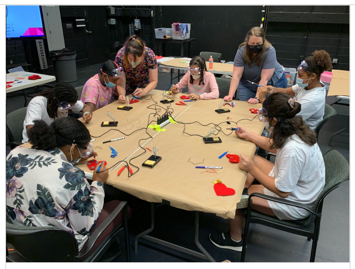
The Dottie Rose Foundation