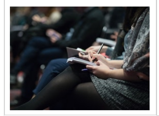
How San Jose's MOMENT is helping build resiliency for community entrepreneurs.

As the need for community information grows, opportunities for local news entrepreneurs abound.