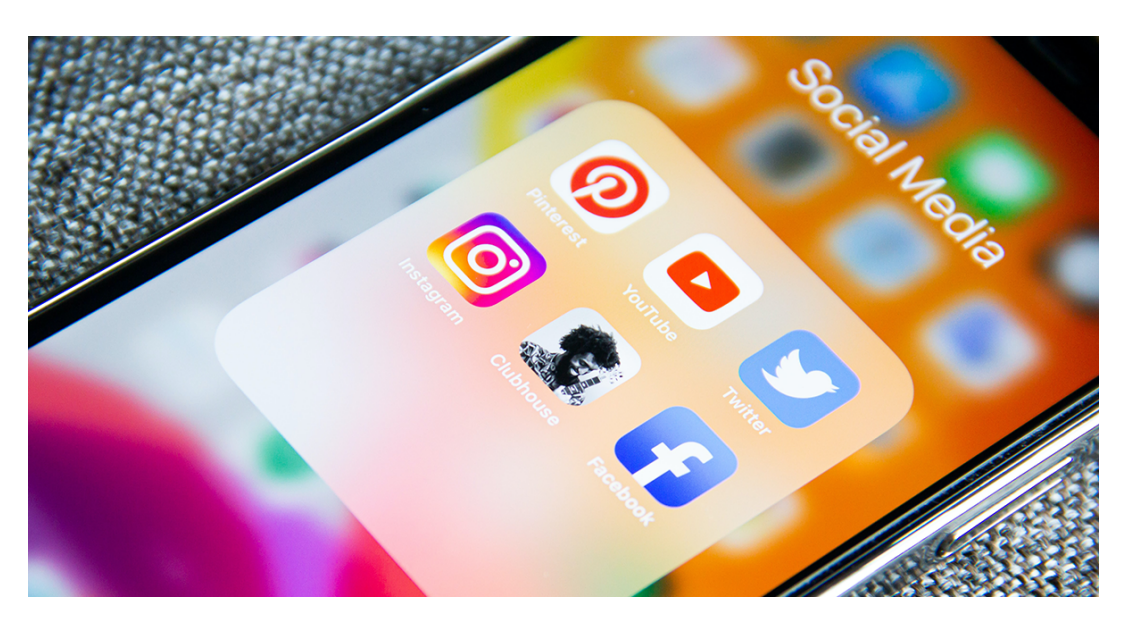
Thurs., April 22, 12 p.m. ET I 9 a.m. PT Tues., April 27, 12 p.m. ET I 9 a.m. PT

Section 230 of the Communications Decency Act of 1996 immunizes some tech platforms with user-generated content from some civil laws that would apply to publishers, authors or speakers. As Section 230 undergoes reexamination, what are important issues for policymakers and tech practitioners to consider? A two-part workshop series, hosted by the National Academies of Sciences, Engineering and Medicine, will explore how law, policy, and technology might better enable management of third party content while preserving free speech and democratic norms.