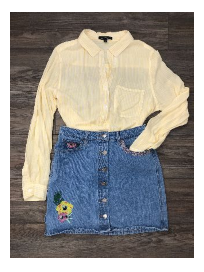
Monthly Fashion Blogs to Come!

We'll be posting new blog posts each month featuring some of Stacee's finds and tips to help you recreate trends such as pairing dresses with sneakers, mixing prints, creating monochromatic outfits, rocking vintage and graphic tees, and more! Follow us on Instagram to stay up on the latest trends and tips and find out when Stacee's pop-up is launching each month: <a href="mailto:@GoodwillSP">@GoodwillSP</a> <a href="mailto:@GoodwillSP">@itsstaceemichelle</a>.