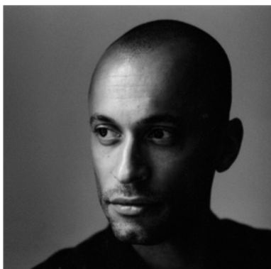
Thomas Chatterton Williams American cultural critic and author