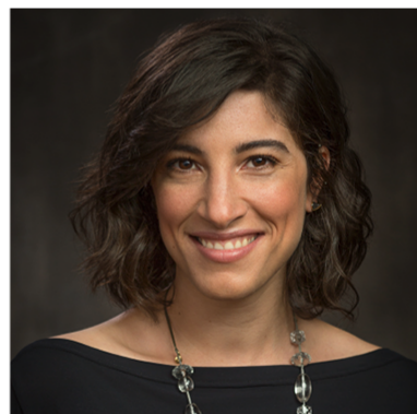
Renée DiResta Stanford Internet Observatory

View the Program and Register Now Knight Media Forum: March 2 - 4, 2021