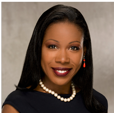
Isabel Wilkerson Author and Journalist