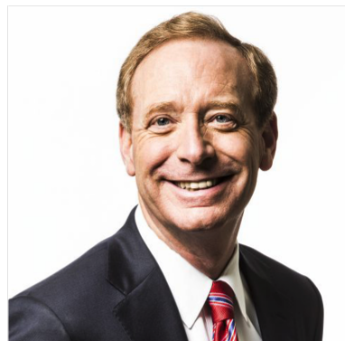
Brad Smith Microsoft President