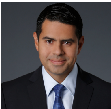
Cesar Conde Chairman, NBCUniversal News Group