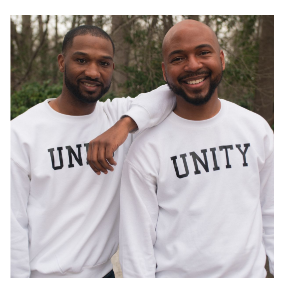
Black Male Educators need a space to feel vulnerable, empowered and super Black, Period!

Literally millions of Americans (red, yellow, Black or white) have never had a Black male educator. Read more.