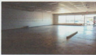
Our New Facility