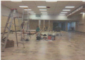
Building the Stage