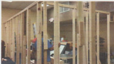
Walls to the Fellowship Hall