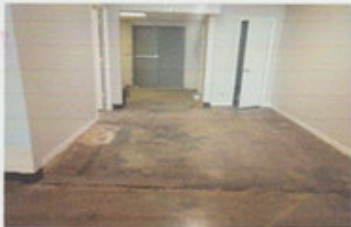
Back entrance and Lounge area