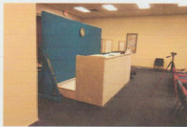
Building the Sound Booth