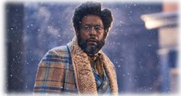
Forest Whitaker (Jeronicus Jangle)

Thank you, Journey for opening my eyes to how I've been viewing the world these past 4 years, and the stress and gloom that has filled my heart with doubt that joy would be possible again.