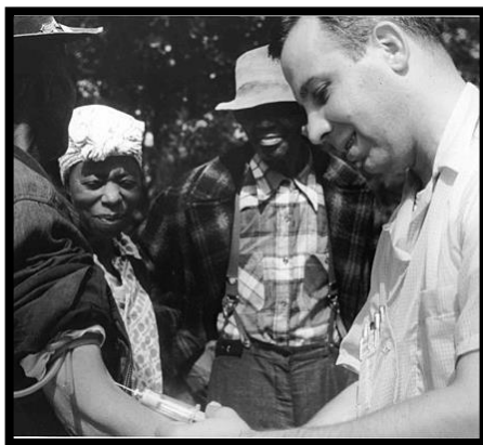
A doctor draws blood from Tuskegee test subject.

Still, some of us are afraid of being guinea pigs. The fear is that there is some sort of catch, and that White doctors may not mean well. I do not know whether that is true or not, but I understand