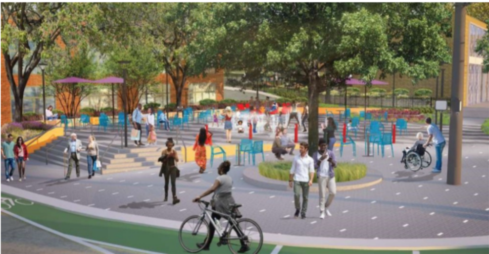
Drafted Model of Front Trade Street Plaza

On October 29, over 50 community members and stakeholders came together to discuss partnering in the programming and management of the space based on a community-requested grassroots model of management. This will be one of many engaging conversations set to take place before its opening next summer. Please contact Erin Chantry if you're interested in the programming of The Plaza.